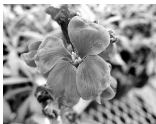
E. cheiri 'Vega Scarlet'