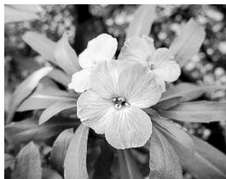
E. 'Spring Perty Perty'