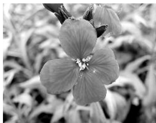
E. cheiri 'Vega Rose Red'