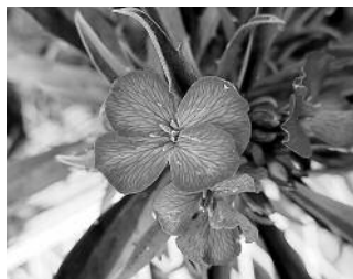
E. 'Monet's Moment'