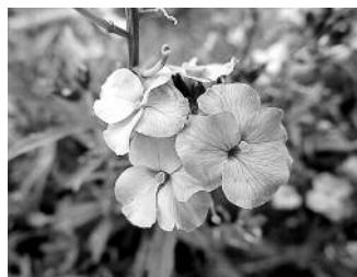
E. 'Pastel Patchwork'