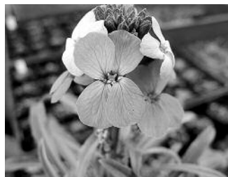
E. 'Bowles's Mauve'