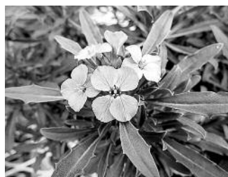
E. 'Artist Paint Box'