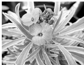
E. 'Cotswold Gem'