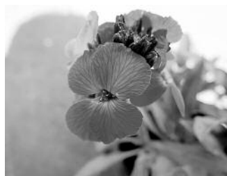
E. 'Spring Perty Joy'