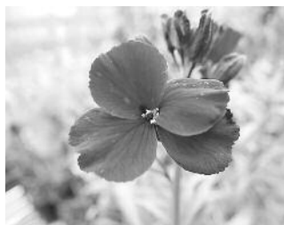
E. 'Spring Perty Rouge'